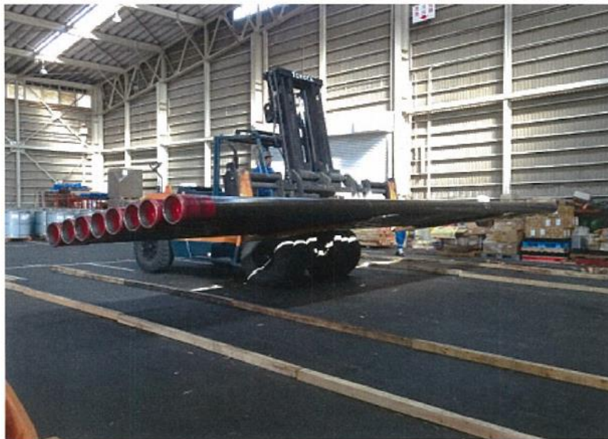
Cargo being stowed in the warehouse