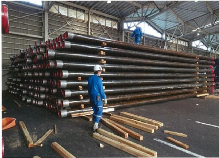
Subsequent stowage and dunnage condition