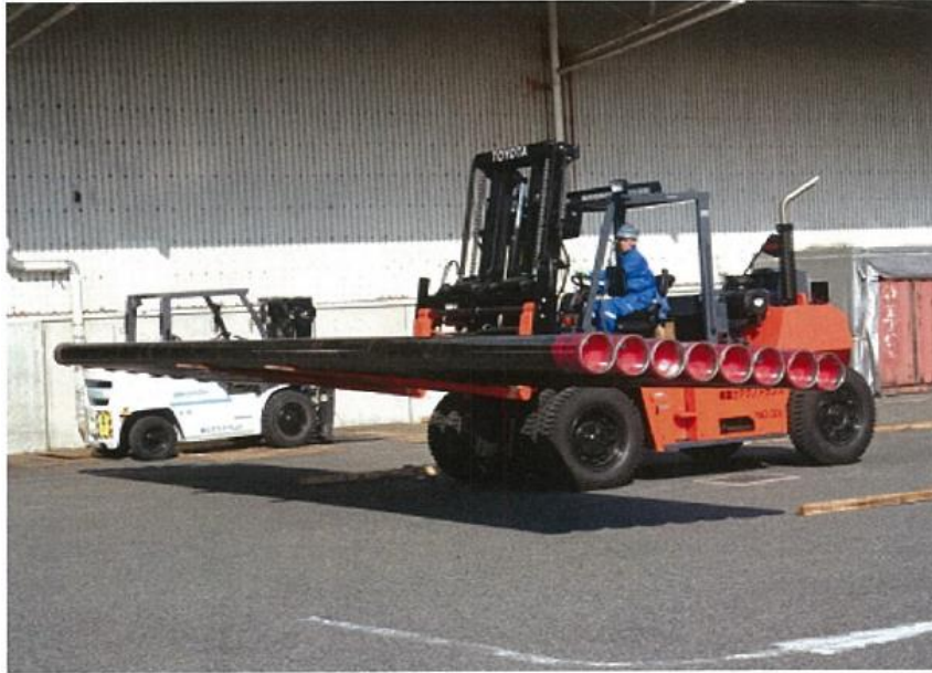
Cargo being picked up by a forklift