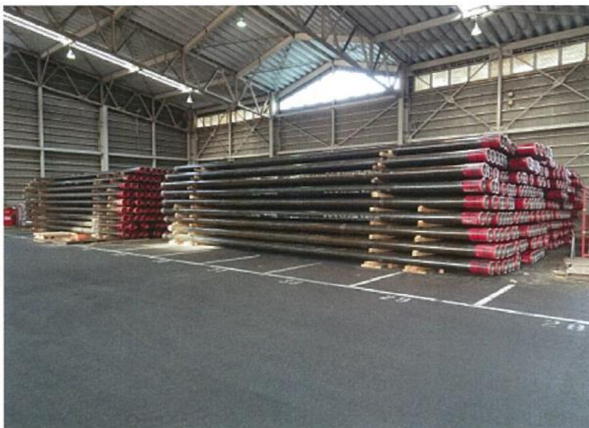
Whole view of final stowage and dunnage condition