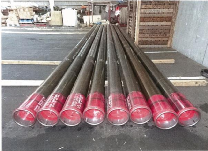
1st stowage and dunnage condition