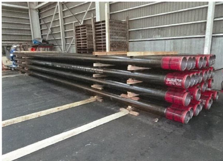
Subsequent stowage and dunnage condition